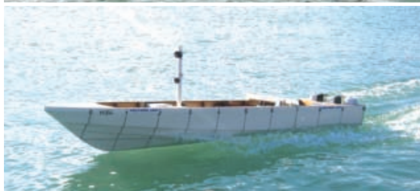
Top: Model of a 26-metre luxury motor yacht executing a turn at 30 knots – Rob Humphreys Yacht Design