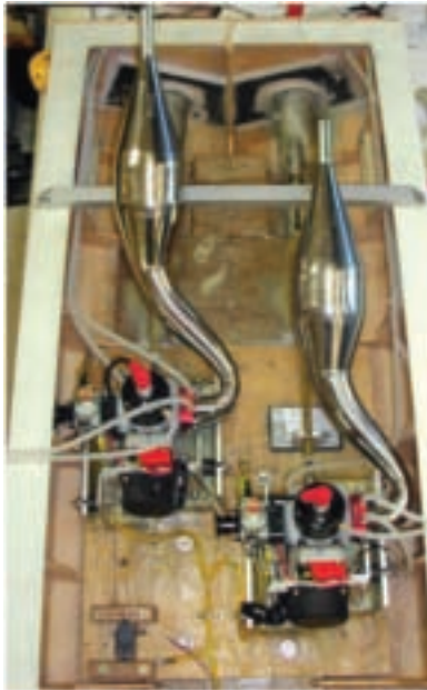
Above: Twin water-cooled 2-stroke engines with direct drive to water jets in a 22-metre, 50-knot patrol boat. Right: Model installation of electric air-cooled brushless motors with voltage regulation.